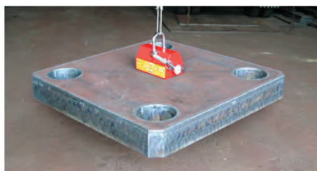
Load and unload plate, block, or round stock