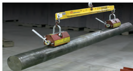
Magnets and spreader bars for large loads.