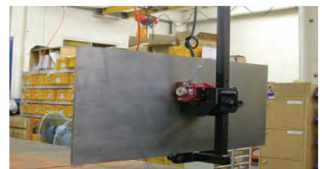
Vertical Lifters for a variety of stock shapes